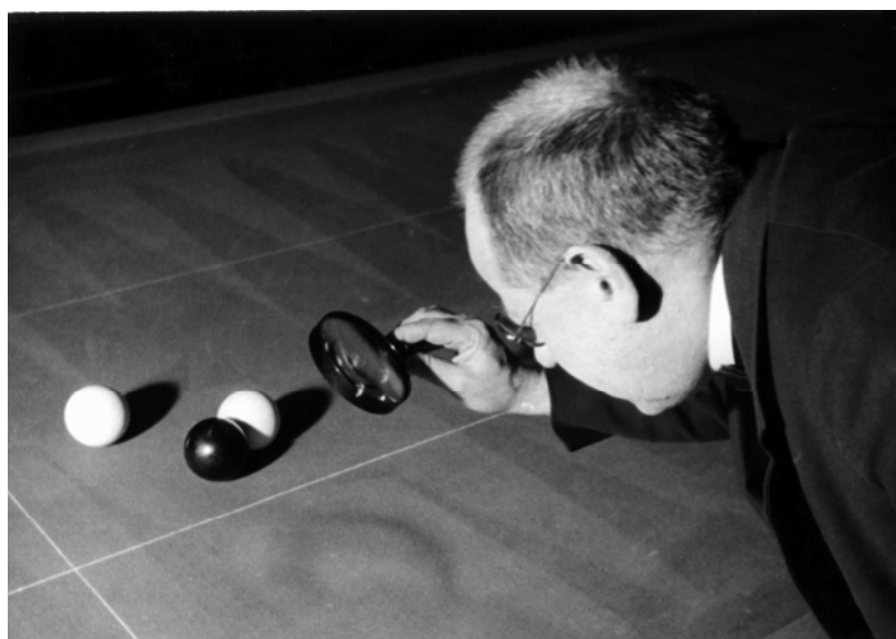
A referee at work with magnifying glass used for the first time.

The billiards were electrically heated, which was already known at that time but quite not common.