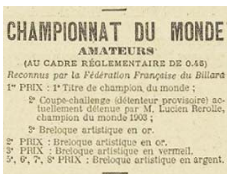
The announced trophies